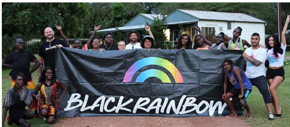
Black Rainbow

The Futures Fund has been created to support self-selected career development and enhancement opportunities across all professions for Indigenous LGBTIQSB community members aged 15-35 years. From 2021-25, Black Rainbow will provide grants of up to $1000 to four Indigenous LGBTIQSB recipients each year with 20 individual grants in total. Read more here .